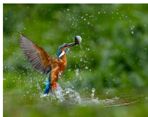
Steve Short ' Kingfisher with fish''