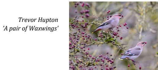
Trevor Hupton 'A pair of Waxwings'